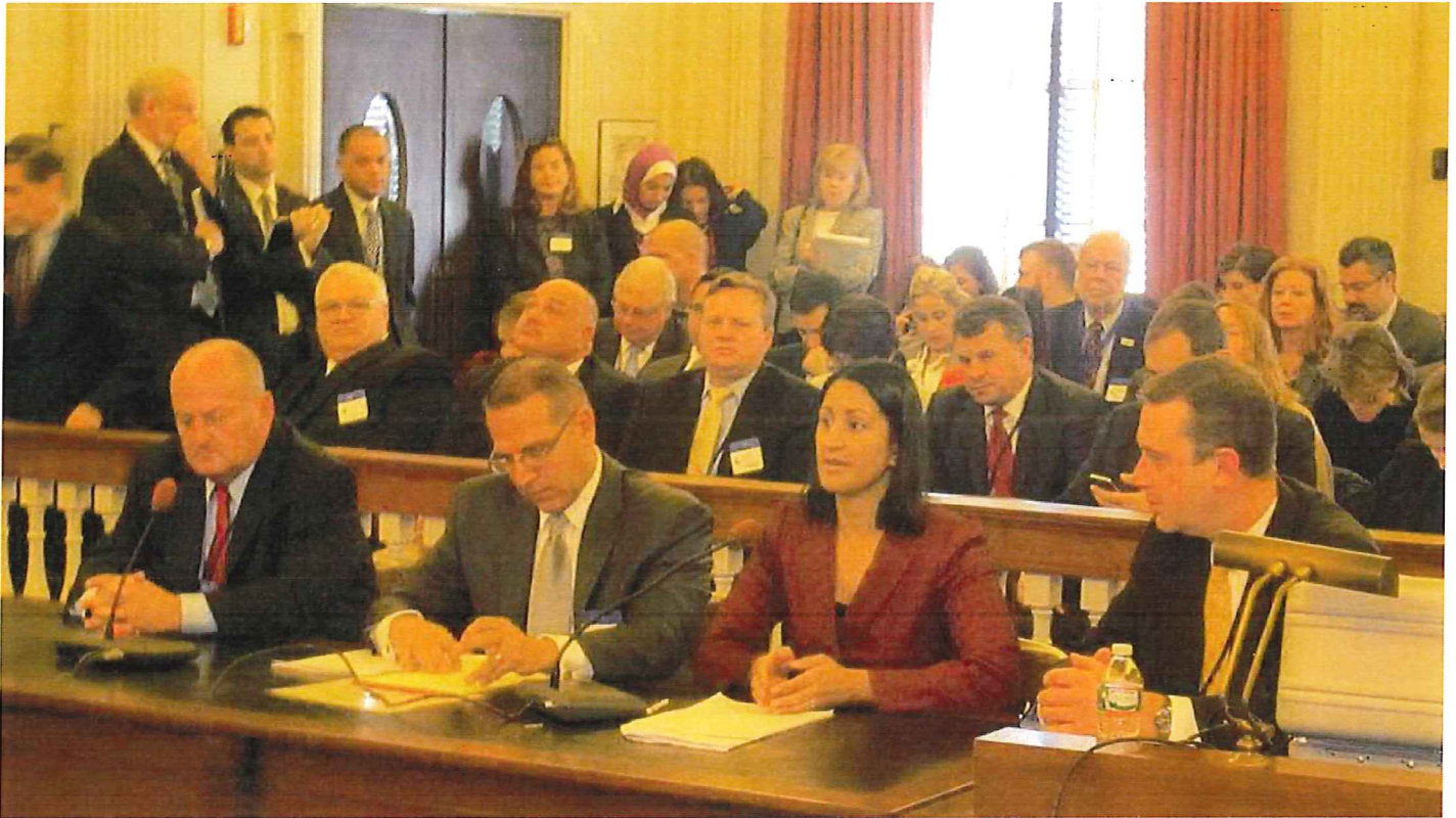
Opponents and supporters of the bill pack Assembly committee hearing room.